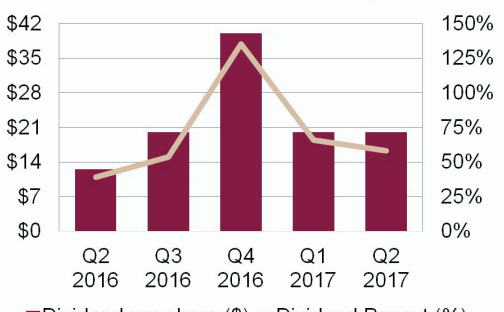
■Dividend per share ($) —Dividend Payout (%)